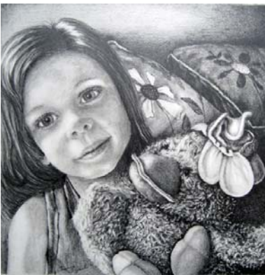
Title: 'Ducky's Honour' Artist: Tannis Trydal