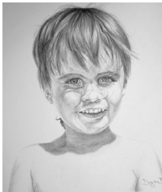
Title: 'Aden' Artist: Brigitte Back