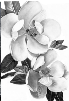
Title: 'Magnolias' Artist: Lyn Donald