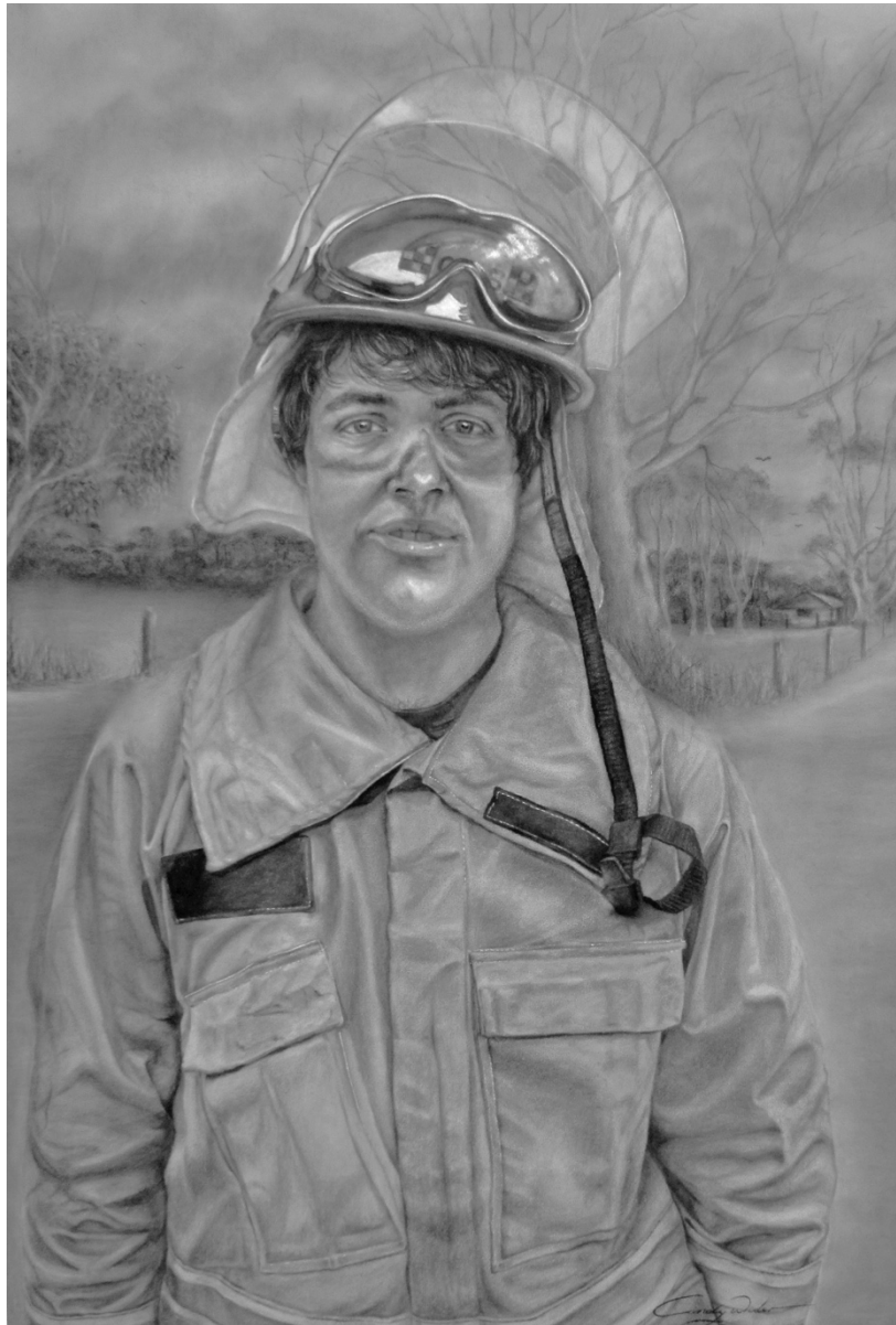
Portrait of A Voluntary Hero Charcoal and White Conte on Grey Mi-Teintes Tex card 70 x 47cm (wide black frame, fine silver strip and black matt with silver bevelled edge total size; 91 x 68 cm)