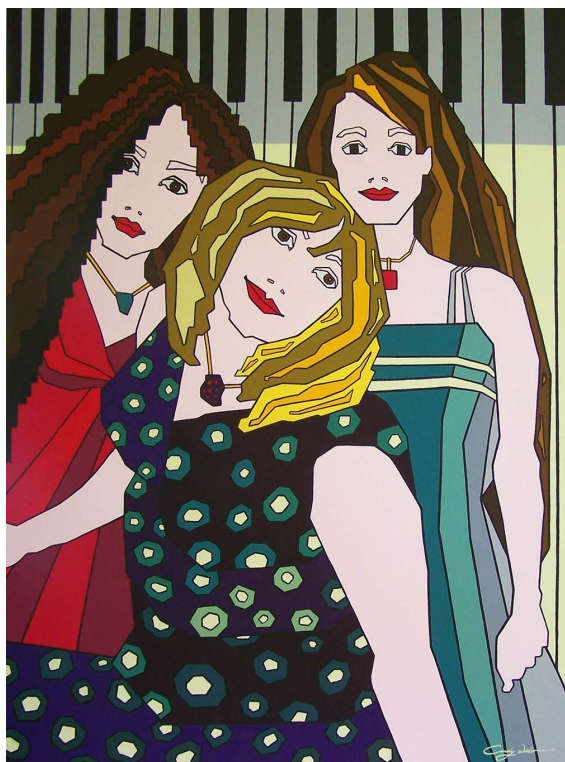
Women and A Piano Acrylic on Canvas 100 x 75cm