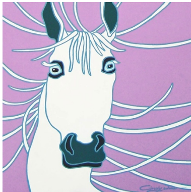
A White Mare