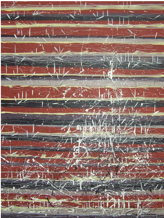
White Collar Farmer Acrylic on Canvas 100 x 75cm NFS

There are gorgeous patterns left in the land as rows upon rows of stubble are left behind after the crop has been removed. This image is inspired by the stubble and the idea that the farmer has more work to do even after the crop comes off.