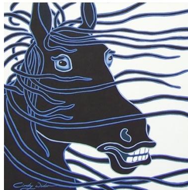
The Black Stallion

A Tribe of Horses Acrylic on Canvas 30 x 30cm