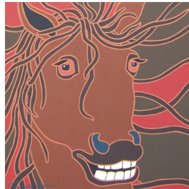
An Older Bay