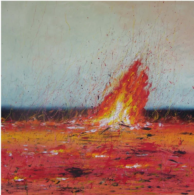
Eruption Acrylic on Canvas 100 x 100cm SOLD

Just like a moment in the heat of passion, a burst of flame ignites after a wildfire has passed over the land. There is beauty in fire, as much as it can take away, it can also give back life to the land, making it once again fertile and able to continue the cycle of life.