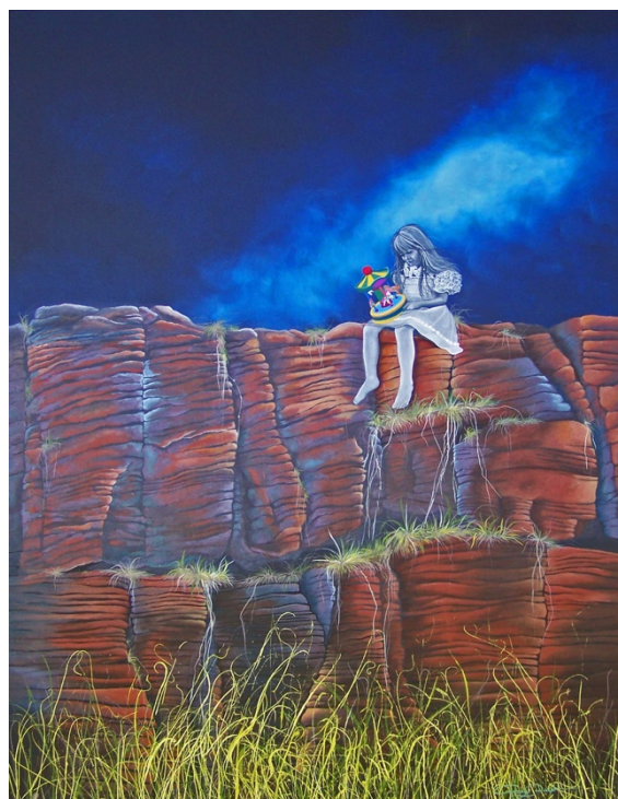
Carousel Acrylic on Canvas 119 x 89cm 100 x 75cm

Wonderful new beginnings are brought about as a result of unexpected circumstances beyond our control.