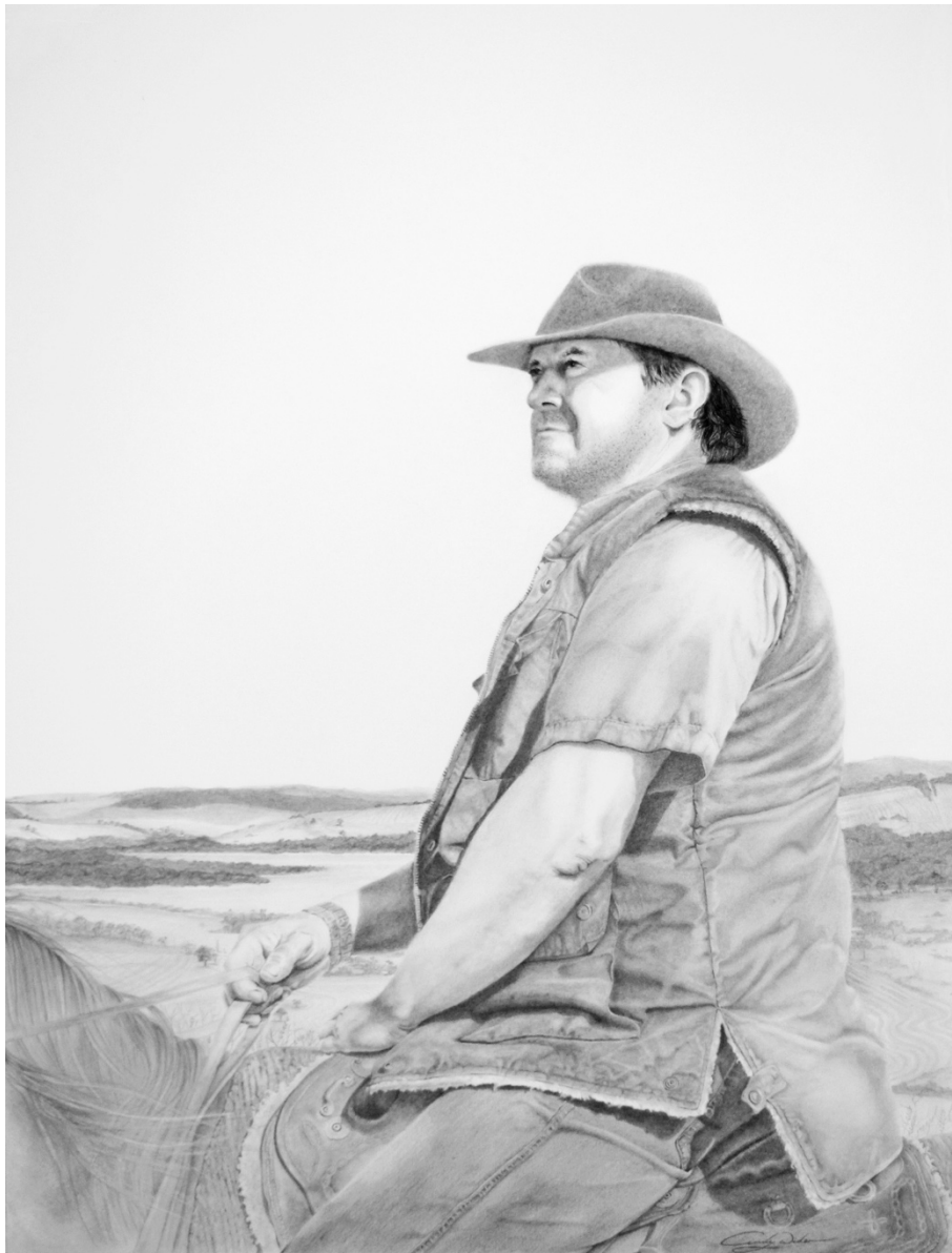
King Of The Land Graphite Pencil and Charcoal on Arches paper 67 x 50 cm (with silver ornate frame and double matt 98 x 80cm)