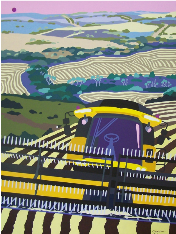
Harvest – On The Home Run Acrylic on Linen 102 x 76cm AUD$1,100 – Kermuller Collection

As the sun begins to set into a gorgeous pink-sky summer evening, the giant Combine Harvester clammers over the hill to make its way back to the machine shed for another year. It has done its job, the crop is off and there is a beautiful feeling of peace and relief in the air.