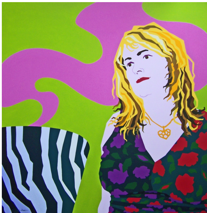
A woman and Her Cuppa Acrylic on Canvas 100 x 100cm

NFS Finalist in the Wayne Kratzmann Flying Arts Queensland Regional Art Awards 2011