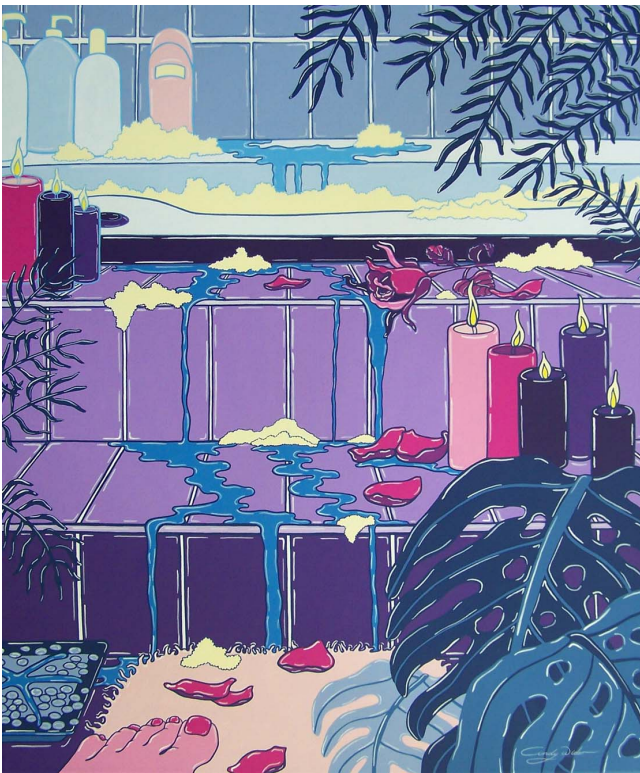
The Holiday Room Acrylic on Canvas 60 x 74cm AUD$675

Holidays are very important for romantic love relationships. The time away gives us a chance to escape the duties and responsibilities of our usual lifestyles and fulfil our fantasies of what romance really is.