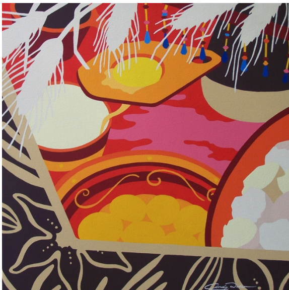
Stiff White Peaks Acrylic on Canvas 50 x 50cm SOLD

The art of creating the perfect Pavlova is indeed a prized skill to possess. The careful separation of the yolk from the egg-white is a delicate operation and a vital step in the process of creating this precious Australian desert. Beating the eggs with some sugar until the perfect 'white peaks' form is also an important stage among other things. Finally, just the right temperature in the oven helps to form the hard crust and soft delicate marshmallow inside of this scrumptious sweet desert.