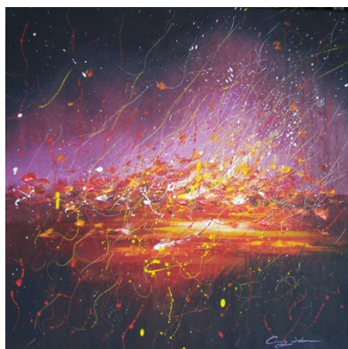
Embers Acrylic on Canvas 50 x 50cm SOLD

Embers sizzle and warm the cool night air, there is an eerie silence. A calm, peaceful stillness.