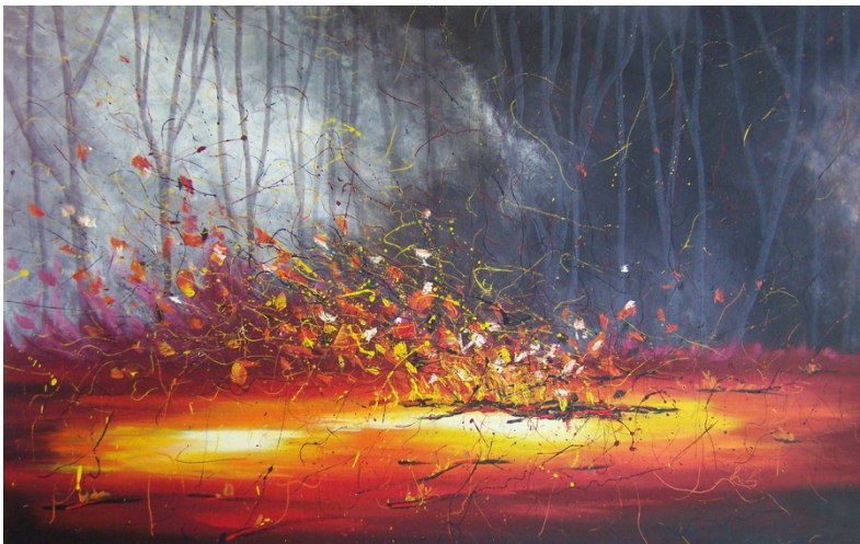
Ignition Acrylic on Canvas 70 x 90cm SOLD