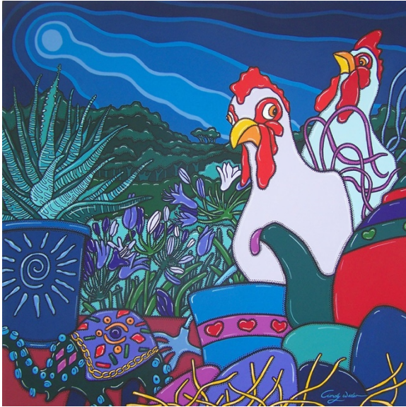
Who's Minding The Nest? Acrylic on Canvas 50 x 50cm SOLD

As the moon rises high into the cool night air, the female hen and male rooster are on the hunt to find their missing eggs. They step with trepidation into the human's kitchen and aha! They discover their eggs. The eggs are spotted in the kitchen ready for human consumption, much to the shock of the hen and the horror of the male. As they see their babies have been kidnapped, the question arises; who's minding the nest?