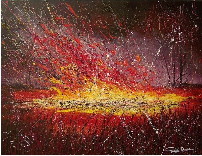
Reignition Acrylic on Canvas 70 x 90cm SOLD

An unexpected circumstance arises; the fire ignites again in the quiet of the still night.