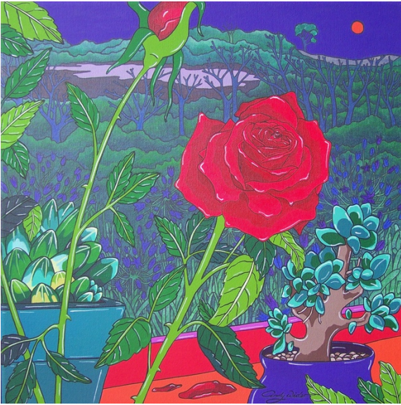
Red Roses For Me Acrylic on Canvas 50 x 50cm SOLD

Red Roses are a strong symbol of romantic love. A woman picks this red rose from her garden and gently slips it into a delicate vase on her window sill. As she gazes out across the fields the sun begins to set and the gentle aroma of sweet perfume from the rose catches her breath.