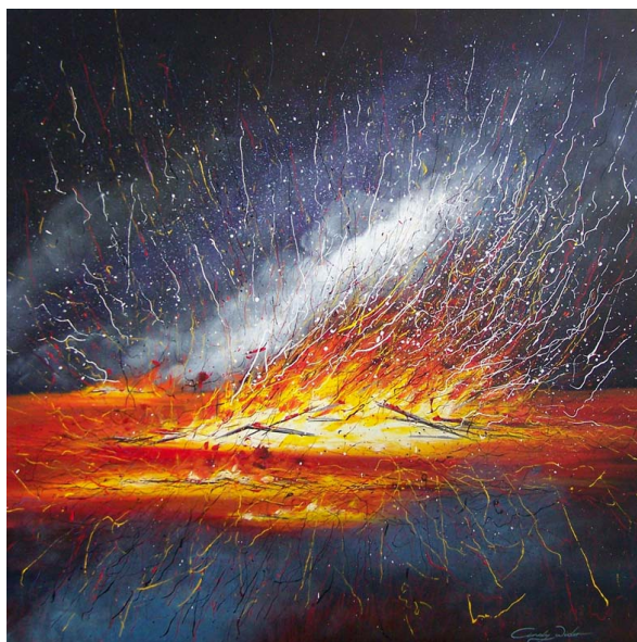
Activation Acrylic on Canvas 100 x 100cm